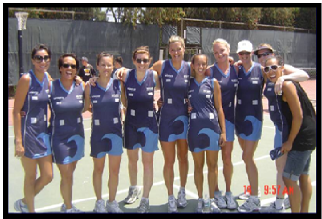
Riptide after the June 14th PCNL game in Carson, Los Angeles.

PCNL "Come down and see a game in a town near you!"